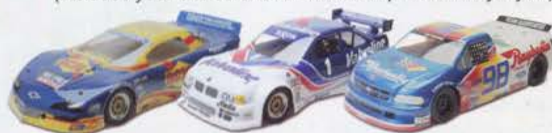
Trans Am Camaro

(includes your choice of one of three unpainted body styles)