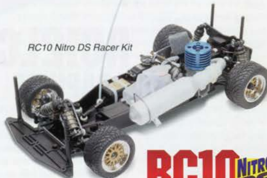
RC10 Nitro DS Racer Kit