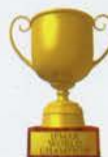
IFMAR '96-'97 WORLD CHAMPION