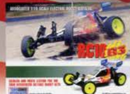
Ask for the latest RC10B3 Off Road catalog

The RC10 has proven itself to be the car to beat for the last 11 years. It won the first ever IFMAR 1:10 Off Road World Championship title in 1984-85, as well as four of the five IFMAR 1:10 Off Road World Championships it competed in.