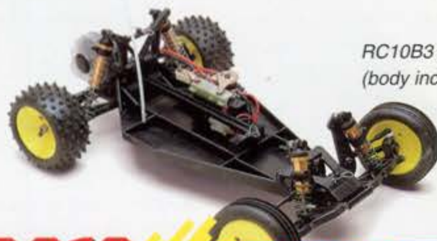
RC10B3 Sport (body included)

The RC10B3 Basic Kit is Associated's low-price, entry-level buggy kit. The B3 Basic Kit is for racers who want to start with a solid, race-proven design, and upgrade gradually as their budget and skills allow. The B3 Basic includes all the features of the Sport Kit, including full bronze bushings throughout, the race-proven 2.40:1 Stealth Transmission, Associated's Gold-anodized shocks, dogbones with stub axles, three-piece wheels with Pro-Line tires, and Lexan body, but does not include the motor or mechanical speed