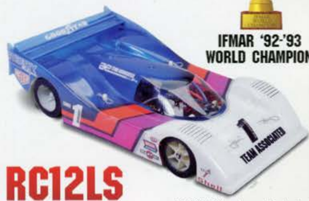
RC12LS (body not included)