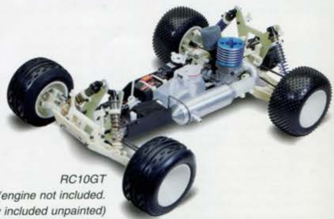
RC10GT (engine not included, body included unpainted)