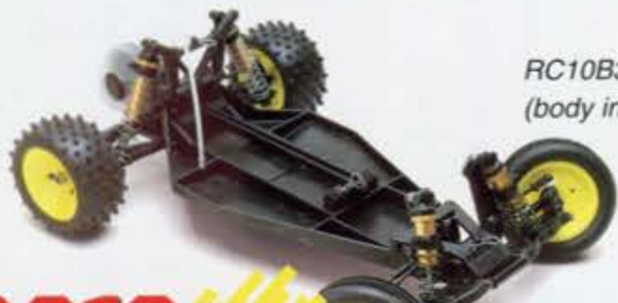
RC10B3 Basic (body included)

stability. The front end's steering geometry has been optimized with redesigned steering blocks for improved Ackerman, improved block carriers with 30° caster, and stronger ball end cups developed for the RC10T3 truck. The B3's drivetrain features the race-proven 2.40:1 Associated Stealth transmission coupled to MIP CVD axles for efficient transfer of power. Hard-anodized, Teflon-coated shocks are used all around for smooth, consistent suspension dampening. Also in the Team Kit, we include the larger, 2.2-inch, lightweight, one-piece dish wheels and Pro-Line tires. The entire package is topped off with a sleek new Lexan body designed to keep out dirt, and includes a decal sheet featuring flashy new "B3" graphics. If you're serious about racing, the B3 Team Kit is your best choice. #9033, $320.00.