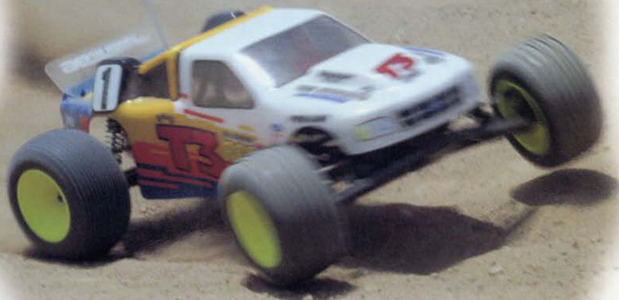
Associated's latest off road truck, the RC10T3. See page 3 for details.

Associated kits and parts are available through your better hobby shops throughout the USA, Europe and the Far East. If you cannot get parts otherwise, you may order parts directly from Associated using our free catalogs. (You may not order car or truck kits from Associated).