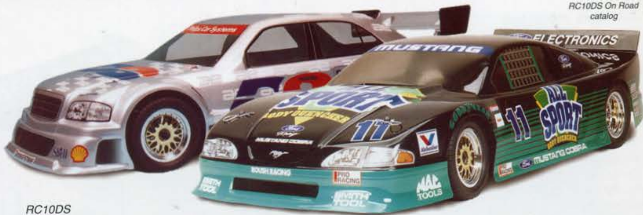
RC10DS Mercedes DTM body

Ask for the latest RC10DS On Road catalog