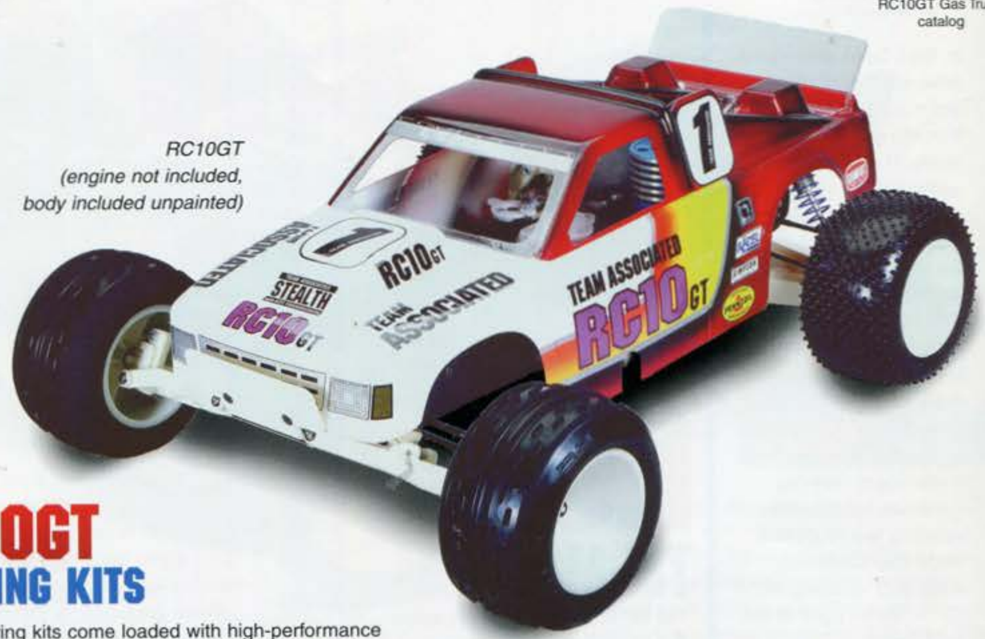
RC10GT (engine not included, body included unpainted)

Associated has now taken the race-winning features of the RC10T and applied them to the RC10GT. It features a new gas truck chassis, new servo saver design, a new laydown Stealth transmission with a final drive ratio of 2.60:1, and a larger diff to handle the higher power gas engines.